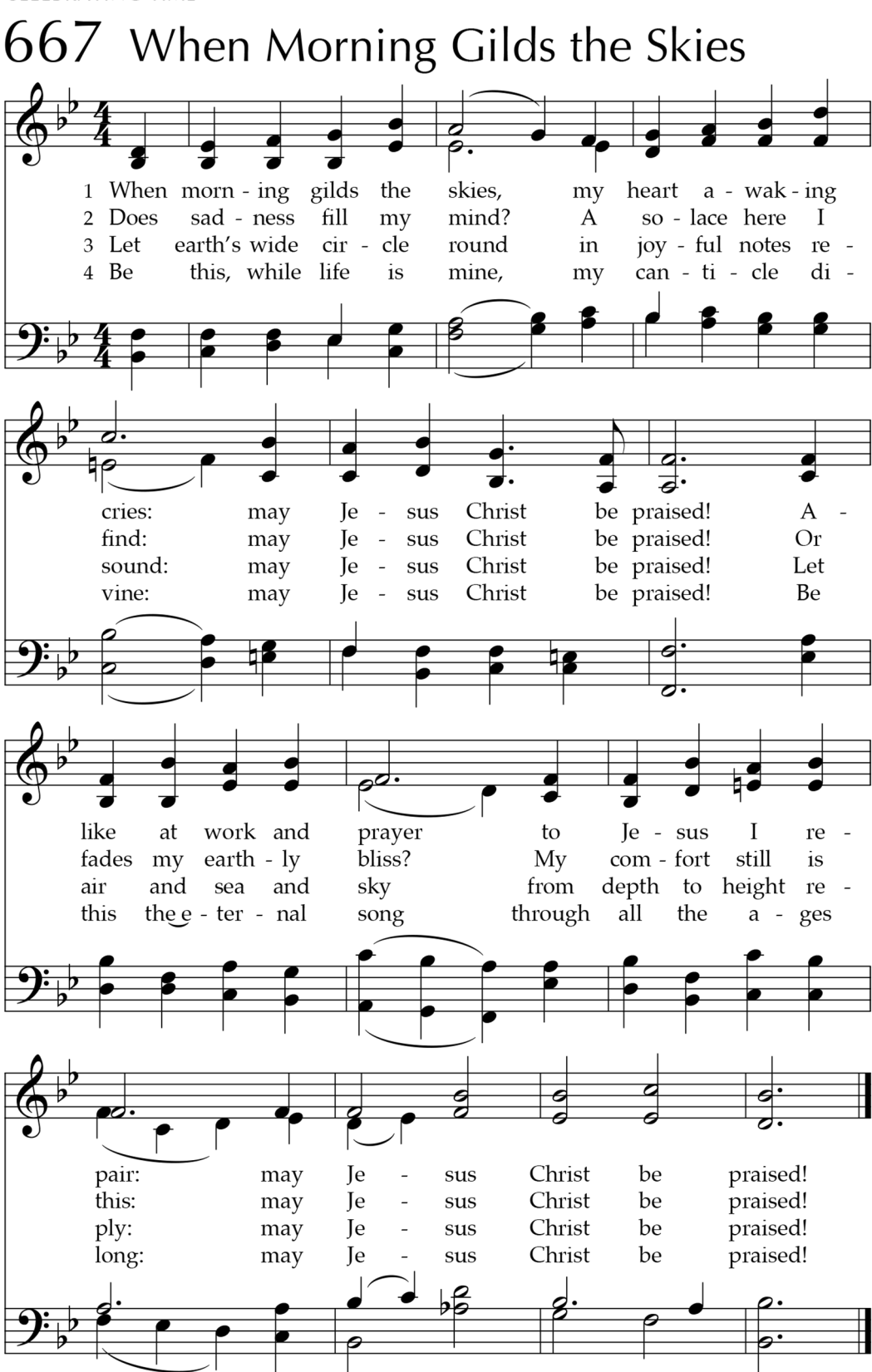
This is not just a morning hymn, though this excerpt from an English translation of an early 19th-century German text may not convey how thoroughly the original deals with different kinds of time throughout the day. The tune was composed as a setting for this English text.