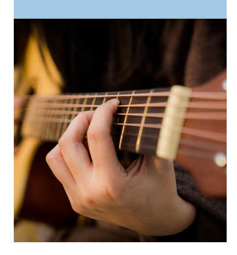
10:00 AM - Noon Songwriters Song Circle

If you are a songwriter or just want to listen, you are welcome!