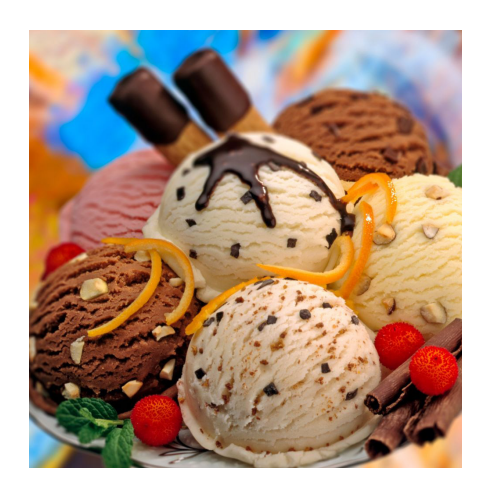
June 9 Ice Cream Social