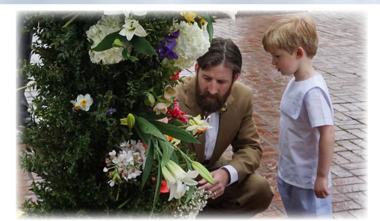
CHILDREN'S MINISTRY MISSION STATEMENT

During Worship, childcare is provided for all preschool children during both worship services. We welcome all children to worship, and we expect that when children are in first grade, they will begin to worship regularly with their families. WORSHIP BAGS, located in baskets just outside the Sanctuary doors, are available for children. Each bag contains some paper, a pencil, and crayons. Families are encouraged to pick up a worship bag for each child when entering the Sanctuary before the service and to return the bags to the baskets following worship, taking with you your child's drawings.