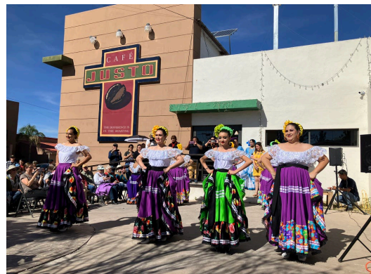
Celebrating the 20 th Anniversary of Café Justo with the growers in Agua Prieta last November.