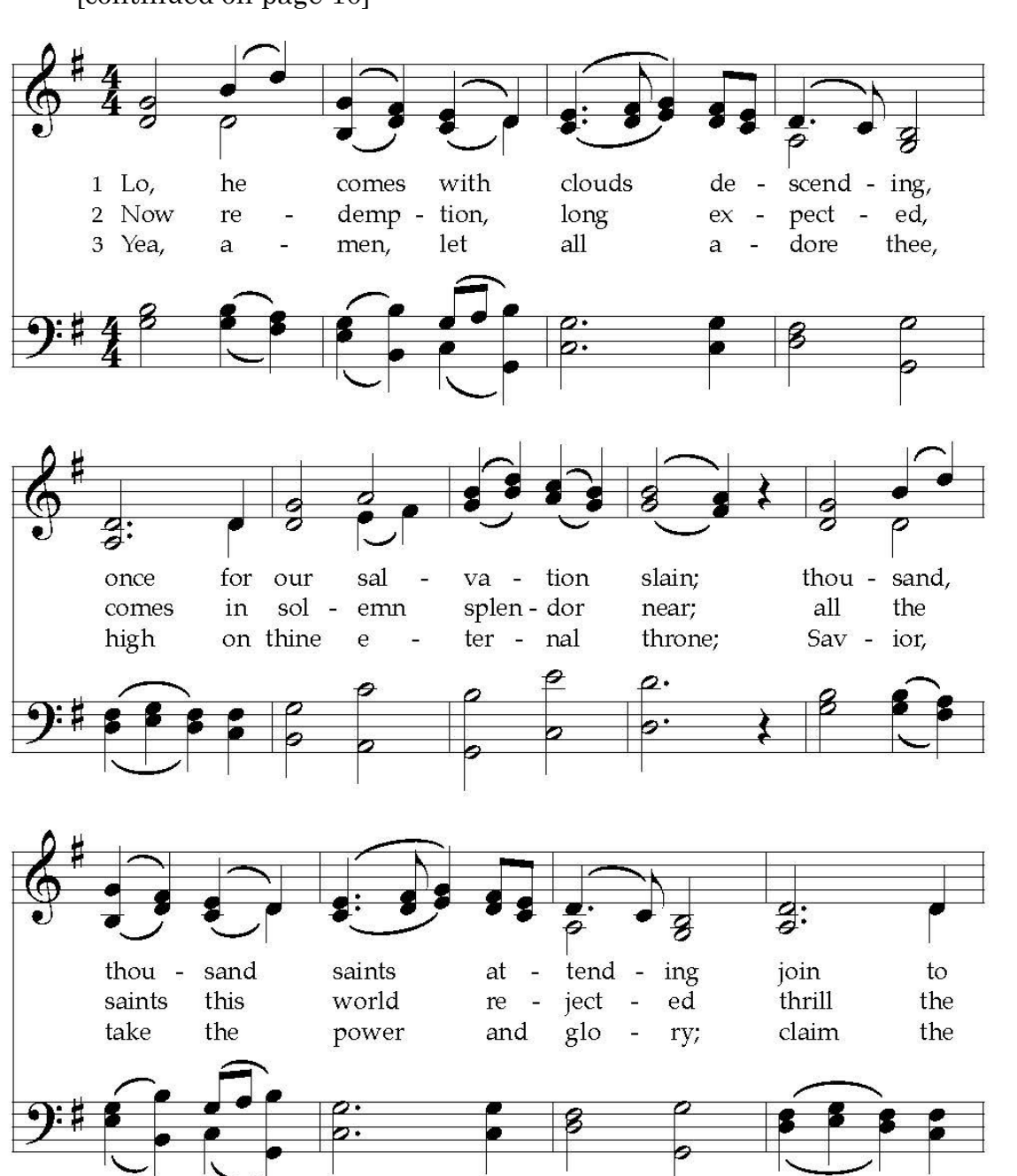
*HYMN 348 Lo, He Comes with Clouds Descending HELMSLEY [continued on page 10]