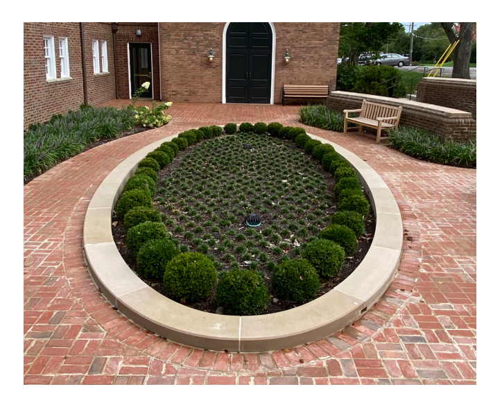
"I am the resurrection and the life. Those who believe in me, even though they die, will live, and everyone who lives and believes in me will never die. John 11:25-26